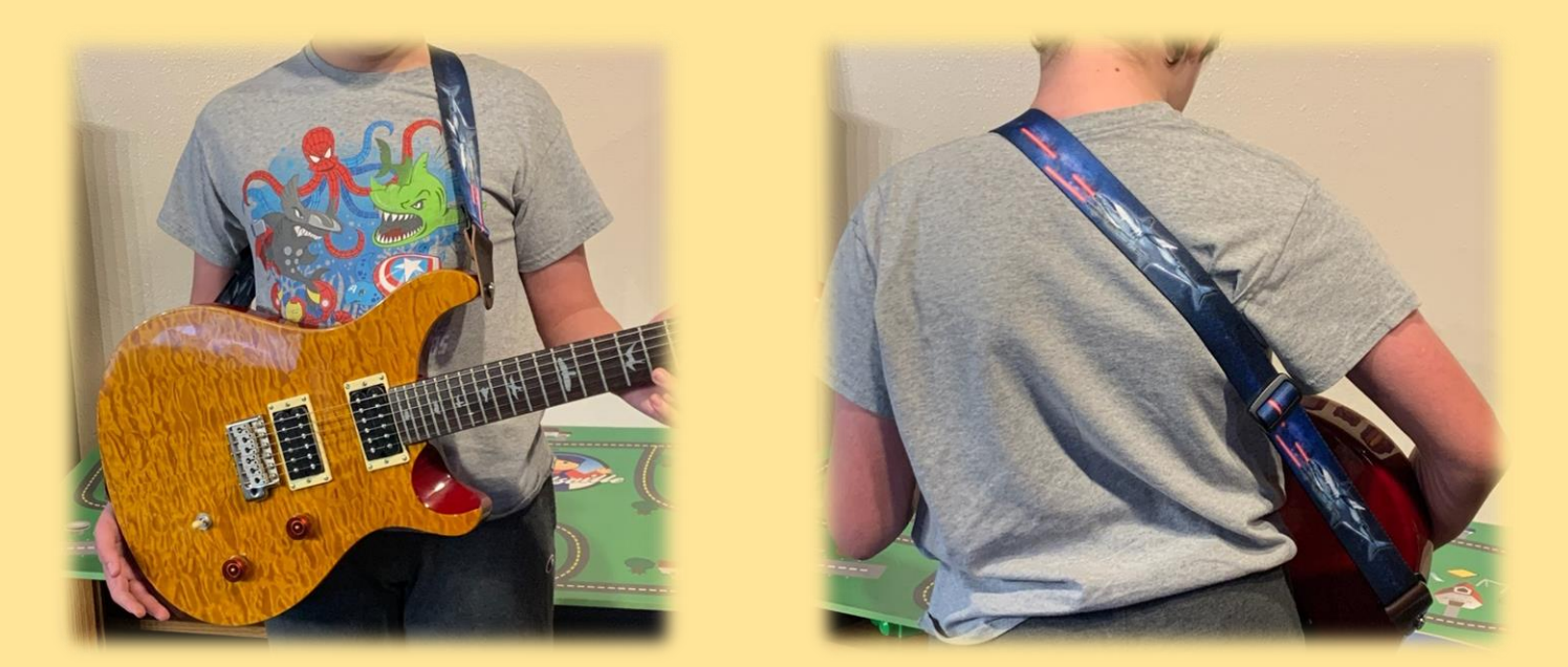
The right fit makes all the difference in their music world! Pictured is our Laser Sharks pattern

Thank you, Jack White. If you don't know, Jack has a serious outreach program for music programs in our public schools. After making our normal 2-inch X 5-foot straps, Jack's staff informed us it was just too much for younger players. They asked us to come up with a more appropriate "Youth Strap". We cut down the length to 4 feet, then we reduced the width to 1.5 inches. VOILA! Our Select Series Youth Strap was born. These reduced-sized straps make a world of difference to younger players, and we all know the longer they play-the more likely it is to have a lifetime customer. Our Select Series starts with our PQ polyester (PQ is for Picture Quality!). Add in your choice of plastic or metal hardware, powder coating options for metal, leather or vegan strap ends, embossing options for the ends, and bulk or packaged display options. Now that's customizing at its finest! Make sure you sell the right strap to each and every player. Stock a few Youth Straps in our neat, focused patterns. And make sure your name is on that strap!